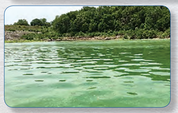
Harmful algal bloom at Milford Lake, Kansas

The USGS is a non-regulatory Earth science agency within the Department of the Interior, founded in 1879, that provides impartial scientific information to describe and understand the health of our ecosystems and environment; minimize loss of life and property from natural disasters; manage water, biological, energy, and mineral resources; and enhance and protect our quality of life. The USGS also cooperates with Federal, State, tribal, and local agencies to deliver long-term data in real-time and interpretive reports describing what those data mean to the public and resource management agencies.