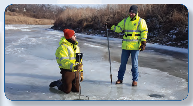
Measuring streamflow under ice conditions using an acoustic Doppler velocimeter

State Water Resources Research Institute Program—The USGS funds the Kansas Water Resources Research Institute to further research and education through Kansas universities.