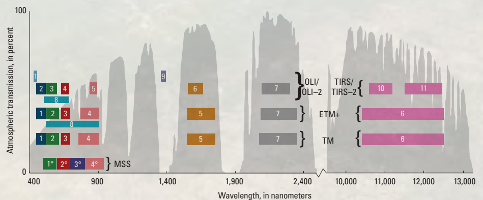
Figure 2. Comparison of Landsat 9's spectral band regions with Landsat 1-5 Multispectral Scanner System (MSS), Landsat 4-5 Thematic Mapper (TM), and Landsat 7 Enhanced Thematic Mapper Plus (ETM+). The atmospheric transmission values for this graphic were calculated using the MODerate resolution atmospheric TRANsmission model for a summertime midlatitude hazy atmosphere (circa 5-kilometer visibility). Numbered rectangles indicate the band number for that particular instrument.

a Thermal bands are acquired at 100 meters resolution but are resampled to 30 meters.