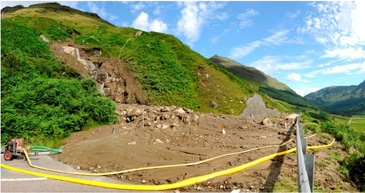
Figure 6 Debris flow deposit blocking the A83 Rest and Be Thankful, August 2012