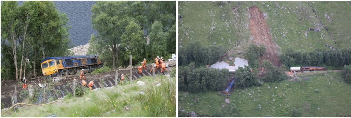
Figure 5 Stob Coire Sgriodain by Loch Treig, in the Scottish Highlands where a train was derailed.