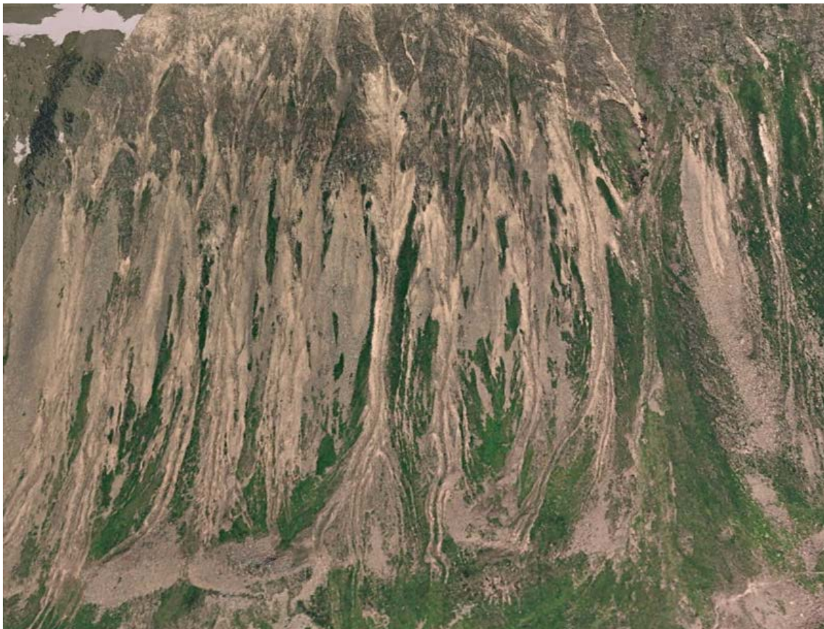
Figure 3 Debris flows in Lairig Grhu, Cairngorms, Scotland showing levée features.

Debris flows consist of three main parts: a source area, track and depositional area.