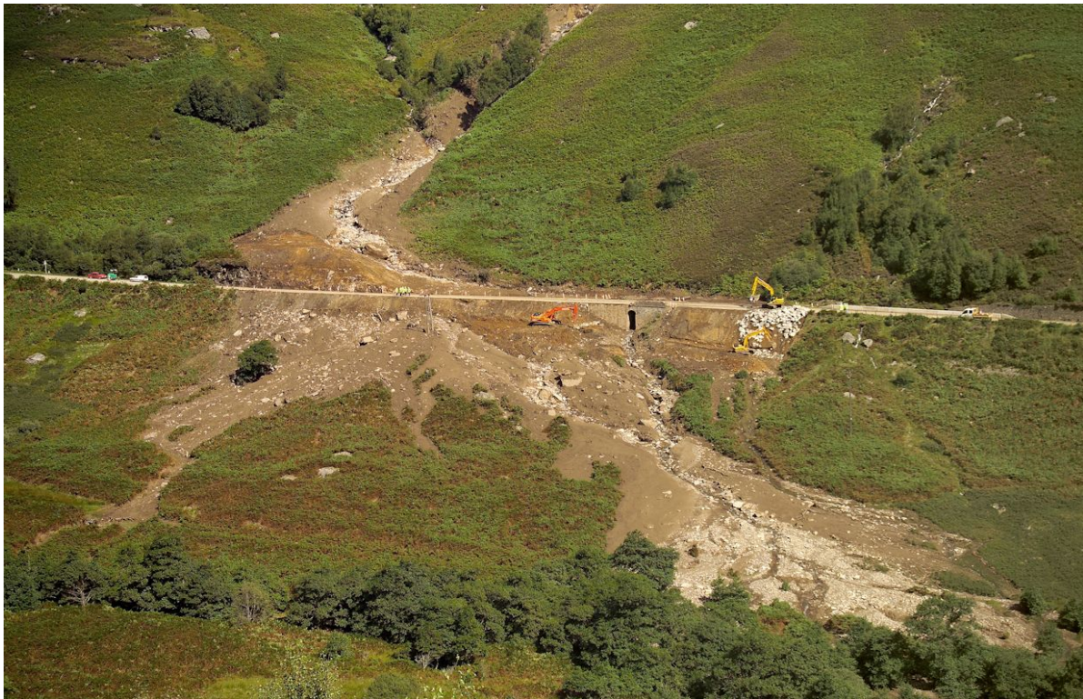
Figure 4 A85 Debris Flow at Glen Ogle. 57 people were trapped in their cars