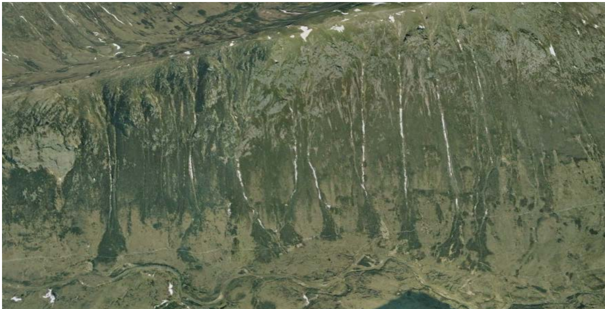
Figure 1 Examples of debris flows in Lairig Ghru, Cairngorms, Scotland.

The term debris flow refers to the rapid downslope flow of poorly-sorted debris mixed with water (Ballantyne, 2004). Debris flows are described by Hungr et al. (2014) as: “ very rapid to extremely rapid surging flow of saturated debris in a steep channel. Strong entrainment of material and water from the flow path ”. They are a widespread phenomenon in mountainous terrain and are distinct from other types of landslides as they can occur periodically on established paths, usually gullies and first- or second-order drainage channels. Debris flows in Great Britain are most commonly found in upland Scotland but also in parts of Wales and the Lake District (e.g. Figure 1).