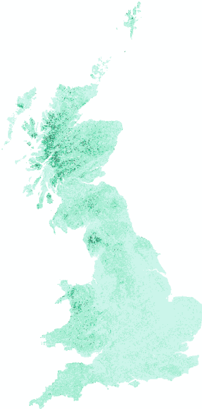
Figure 8 Extent of coverage of the Debris Flow Susceptibility Model.

The Debris Flow Susceptibility Model covers Great Britain (Figure 8). This does not include the Isle of Man, the Channel Islands or Northern Ireland.